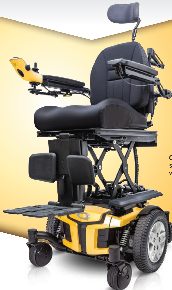
Q6 EDGE® HD shown in Yellow Blaze with iLevel® technology